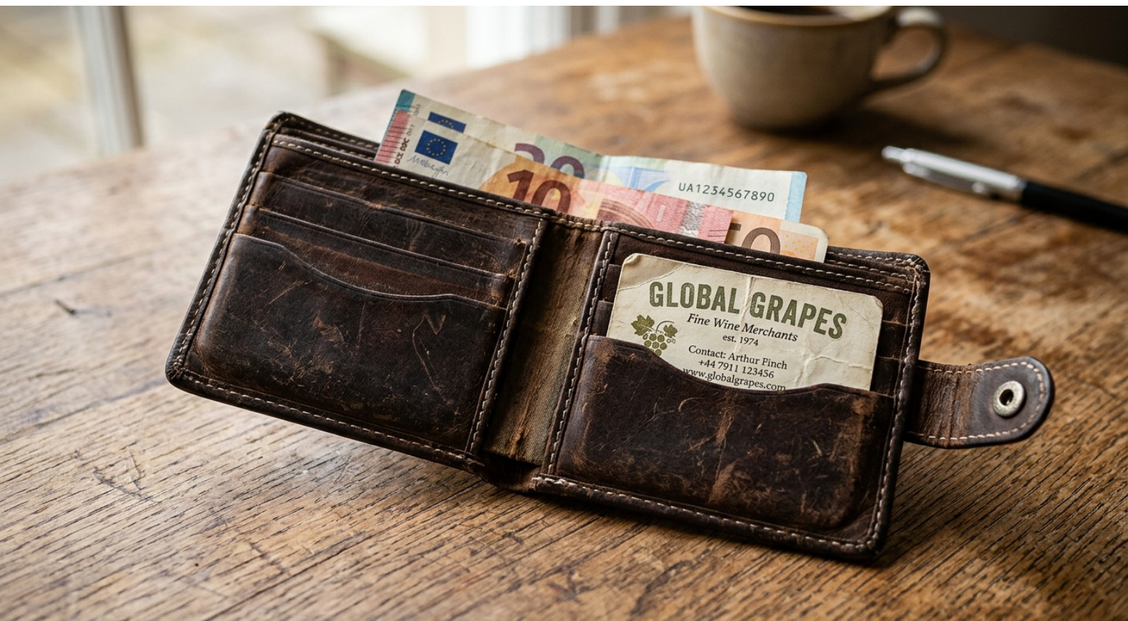
Envelope 2: The Harvest of Secrets — Recovered Wallet (Photo)