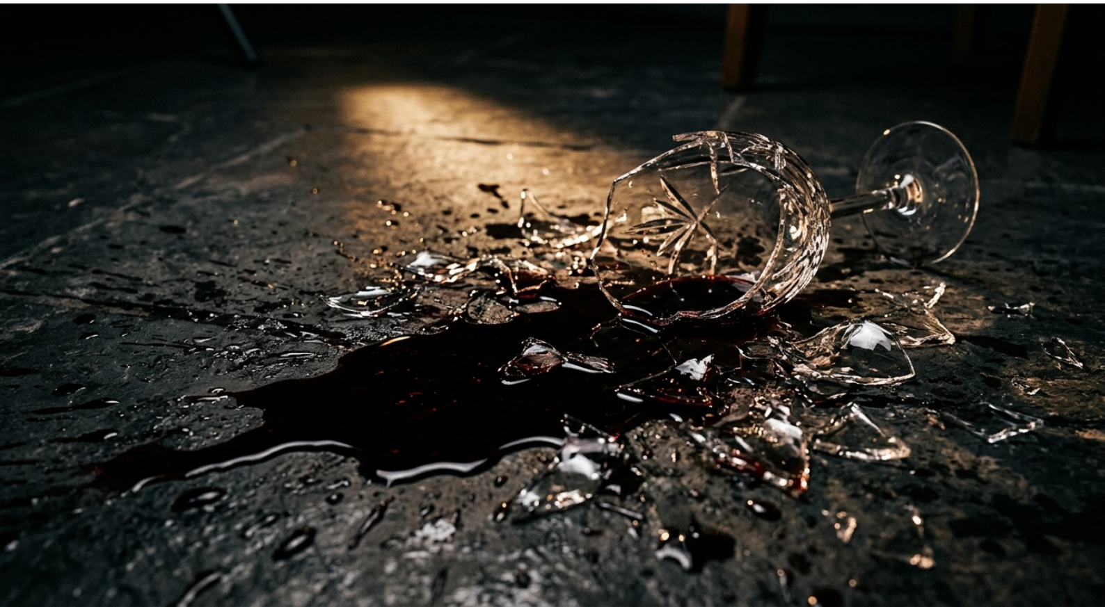
Envelope 1: The Scene of the Toast — Photo of the Shattered Glass (Photo)