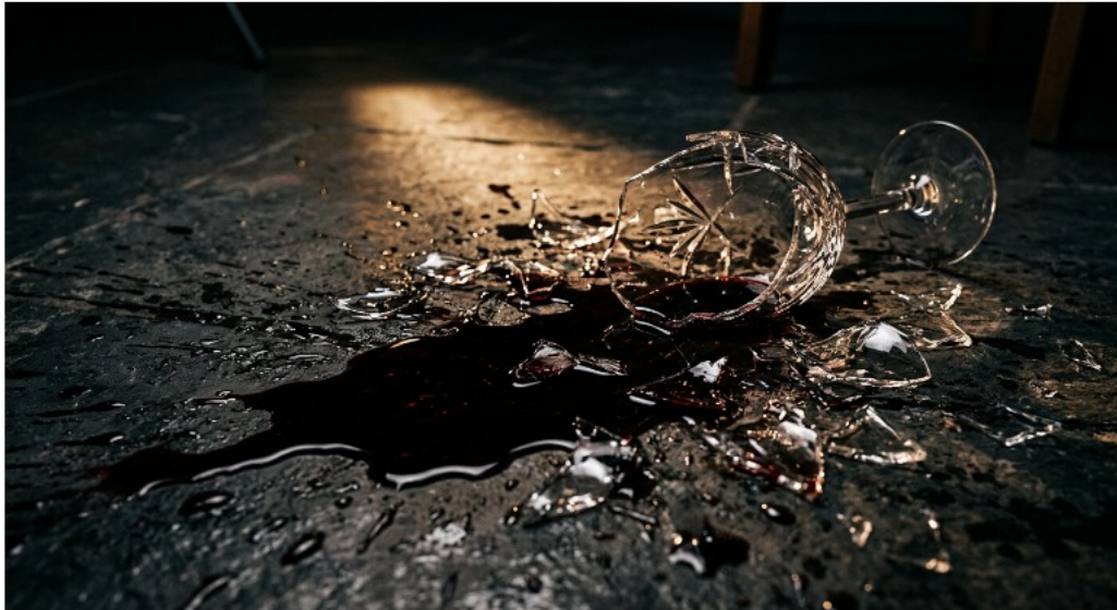
Fig 1.1: Primary Evidence Item as found on cellar stone floor.