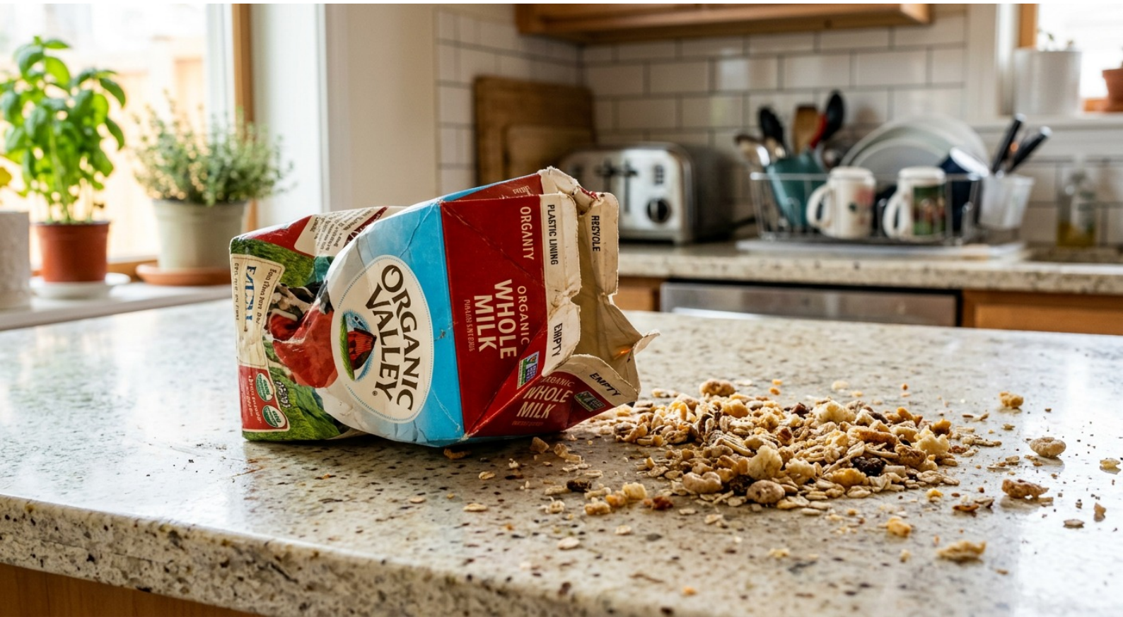
ENVELOPE 1: The Scene of the Crime — Empty Milk Carton